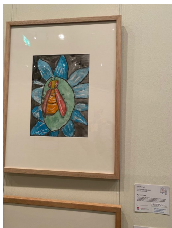
EARLY STAGE 1 - KALKI