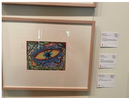
STAGE 1 - FELIX