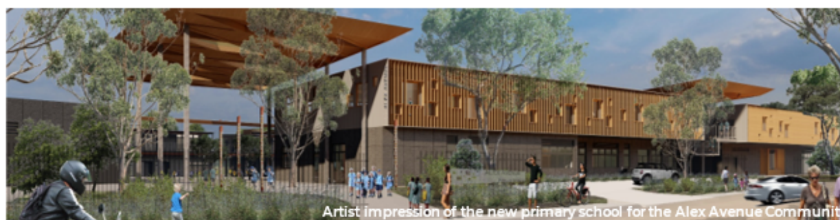
Artist impression of the new primary school for the Alex Avenue Community